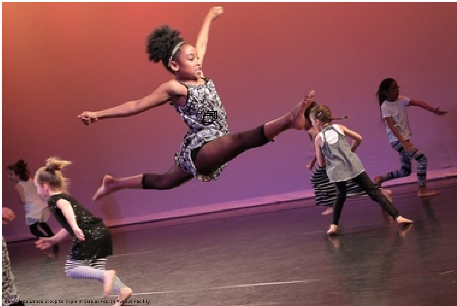
Park Slope Dance Group to Triple in Size at Fourth Avenue Facility