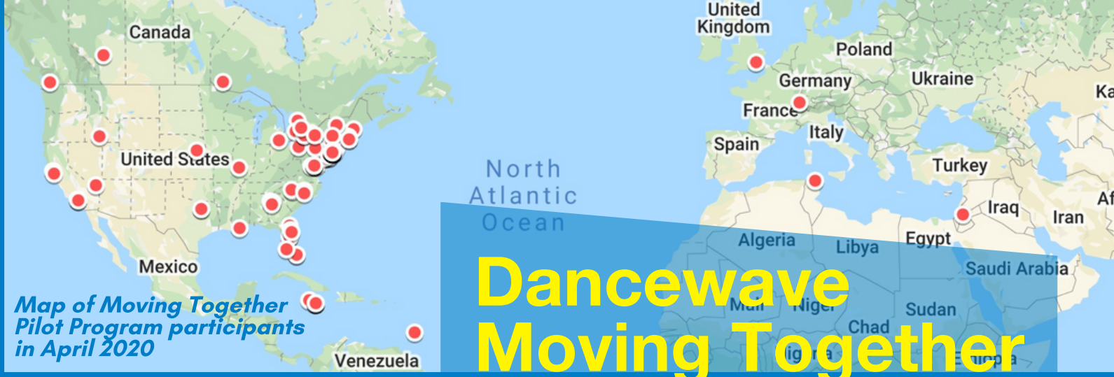
Map of Moving Together Pilot Program participants in April 2020